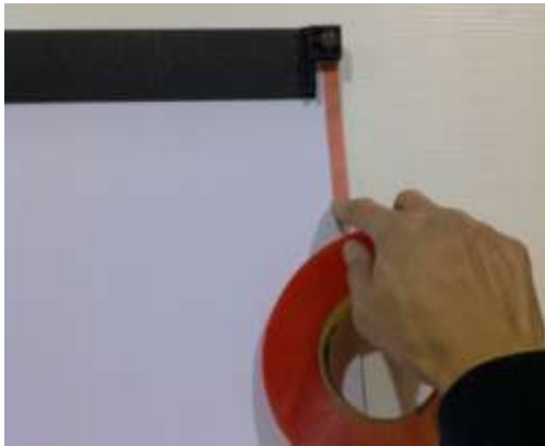
Attach the adhesive tape along the edge of the graphic all the way to the bottom