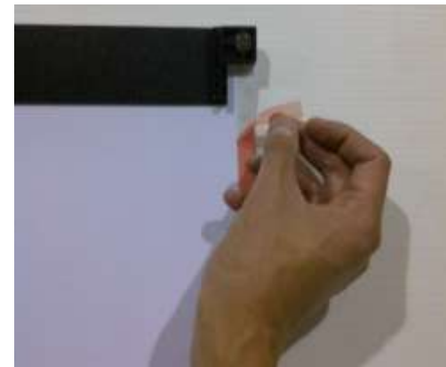
Peel off the lining on the tape