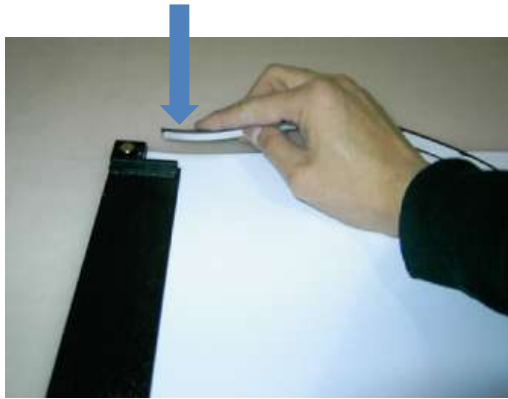
Peel off the paper lining from the magnetic strip