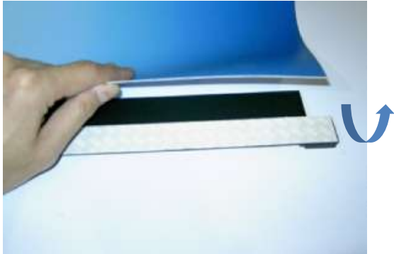
Peel off the paper lining from the stiffener