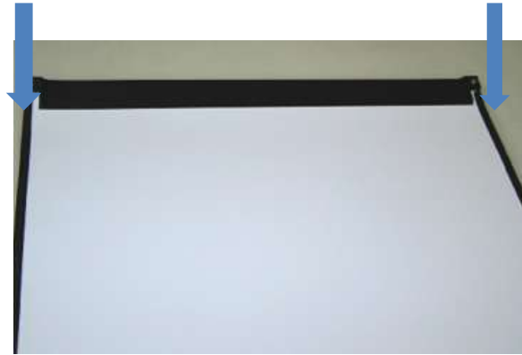
Attach the magnetic strip on the tape along the edge of the graphic all the way to the bottom