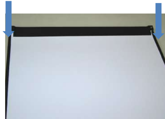
Attach the magnetic strip on the tape along the edge of the graphic all the way to the bottom