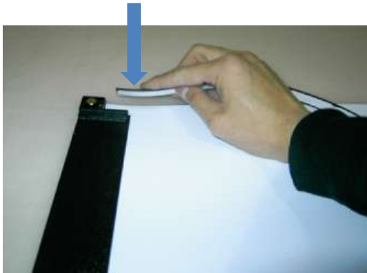
Peel off the paper lining from the magnetic strip