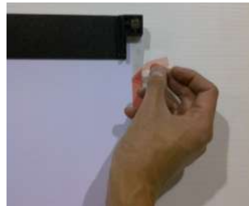
Peel off the lining on the tape