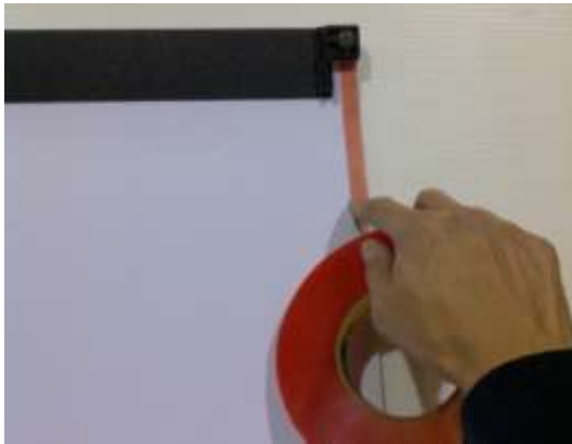
Attach the adhesive tape along the edge of the graphic all the way to the bottom