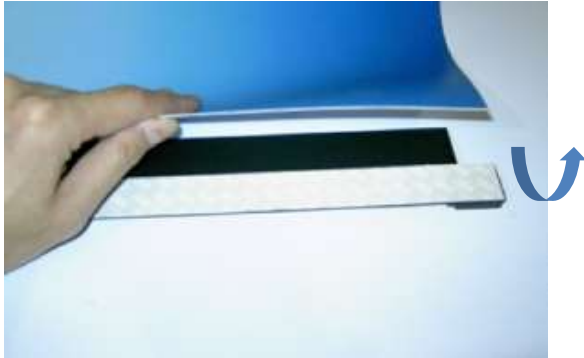
Peel off the paper lining from the stiffener